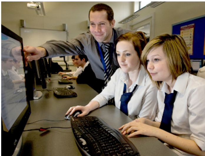
Vision2learn for schools at Weston Road High School

Weston Road High School in Stafford is using vision2learn for schools e-learning to diversify its curriculum and keep students motivated and engaged with learning. Pupils at the school get the chance to study vocational online courses enabling them to gain new work and life skills and achieve extra qualifications which contribute to their GCSE points.