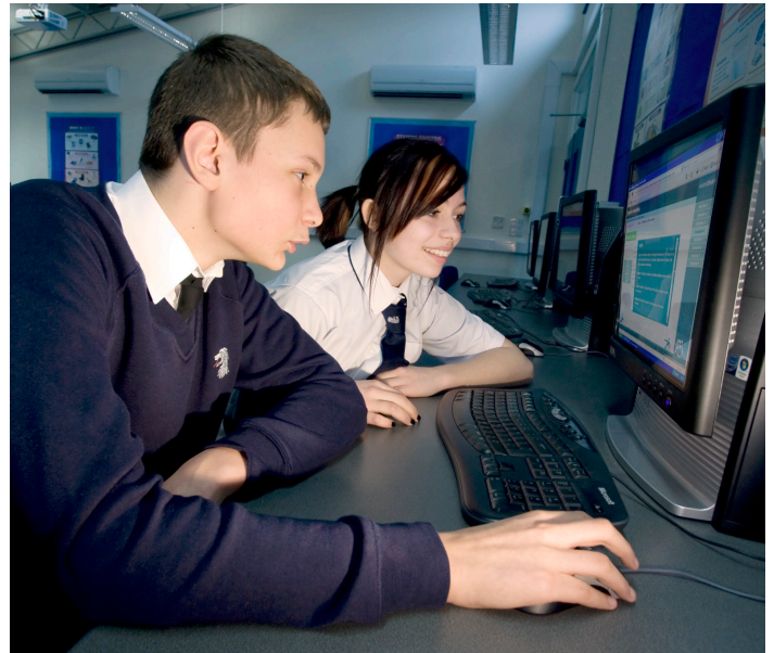
Students at Weston Road High School