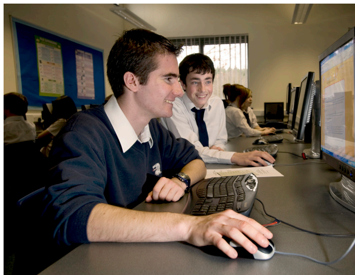
Students at Weston Road High School

All vision2learn for schools courses lead to nationally recognised qualifications with GCSE equivalent points and can contribute to students’ overall achievement. Pupils can learn at their own pace on computers, completing units and submitting work via the vision2learn for schools e-learning environment. Teachers at the school can track students’ progress as they go, receiving assignments and sending feedback via the internal email facility.